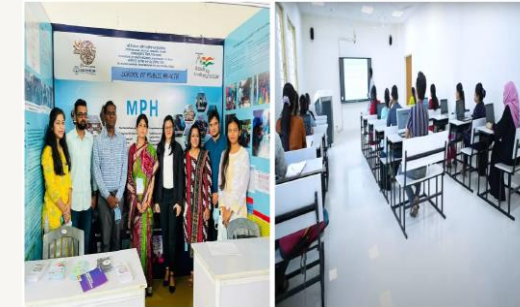
School of Public Health