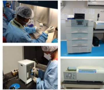
National Reference Laboratory for TB