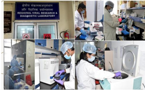
Regional Virus Research and Diagnostic Lab