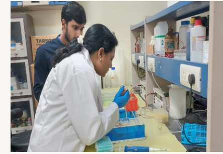
Parasitology and Hemoglobinopathy lab